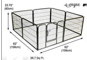
Amazon heavy duty play pen