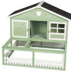
Blossom hutch pets at home