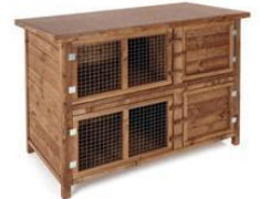
Double guinea pig hutch by pets corner (Separate run required)