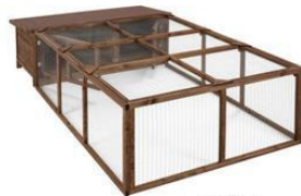
Pets corner great and small single guinea pig hutch with great and small fun run