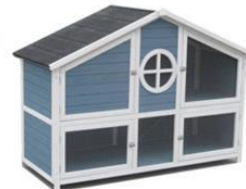
Foxglove hutch pets at home (Separate run required)