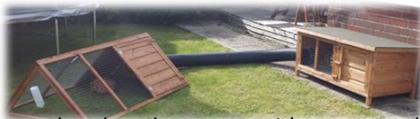
Pets corner hutch and apex run with run around tunnel connection