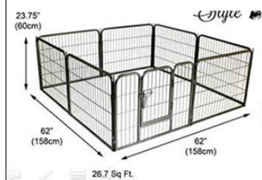
Amazon heavy duty play pen