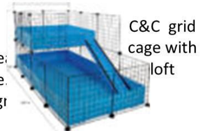
C&C grid cage with loft