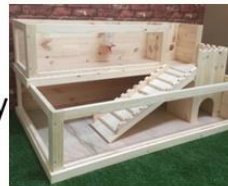
Manor pet housing guinea pig enclosure. Different design available