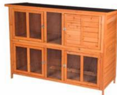
Bluebell hideaway pets at home (Separate run required)