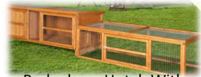
Bedgebury Hutch With Adjoining Run (buttercup farm)