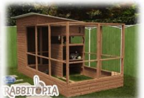
Rabbitopia (Different designs available)