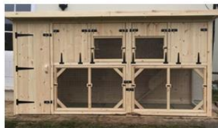
Manor pet housing the hutch