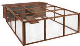
Pets corner great and small jumbo hutch with jumbo fun run