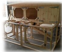
Boyles pet housing Daisy rabbit hutch and run