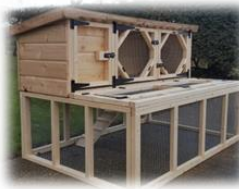
Dunster house bunnery