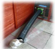
Run around connection tunnels