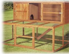
6ft Kendal hutch and run