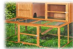
6ft kendal hutch and run