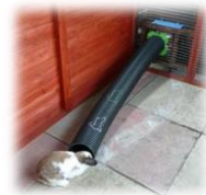
Run around connection tunnels