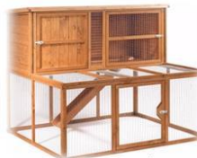
Sycamore Lodge Single Hutch and Double Run