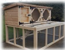
Rehutches Single Rabbit Hutch With Run XLarge