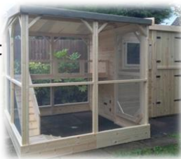
Manor pet housing freedom bothy