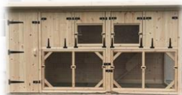
Manor pet housing the hutch