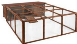
Pets corner great and small jumbo hutch with jumbo fun run